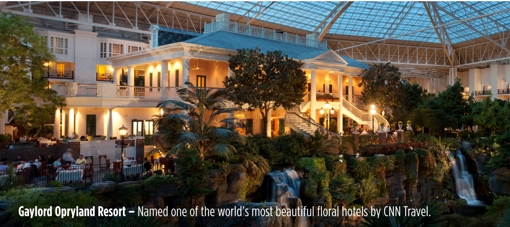
Gaylord Opryland Resort - Named one of the world's most beautiful floral hotels by CNN Travel.

12:00 Door Prizes & KCOTN Silent Auction Winners Announced for Pick-Up